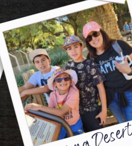
Living Desert Zoo